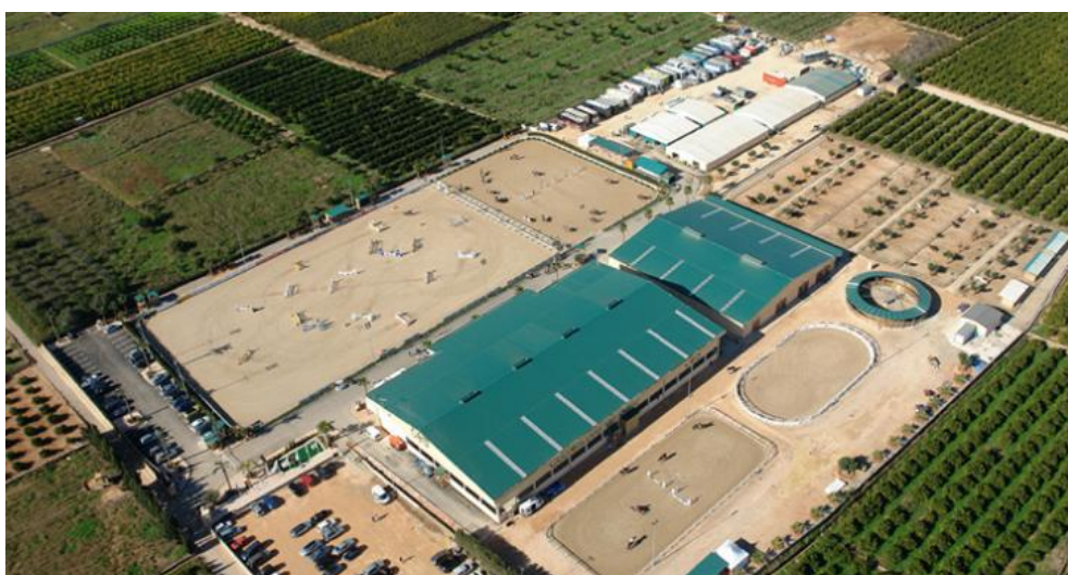
CENTRAL MEETING POINT FACILITIES